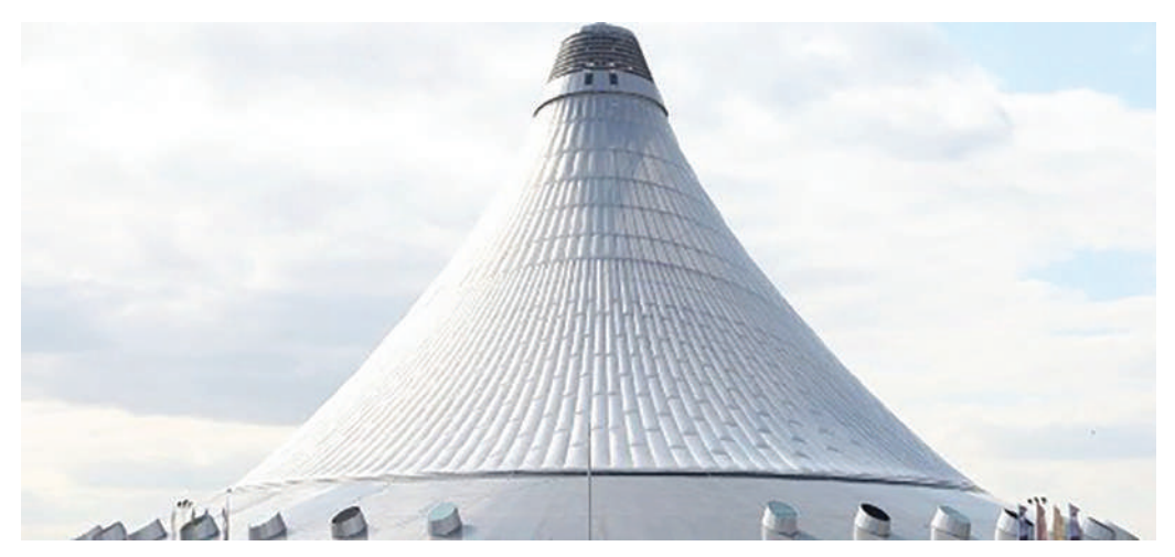
Pic. 4. – A mega power/water plant shape. Could be builtat a sea cost, offshore foundation or in a desert.