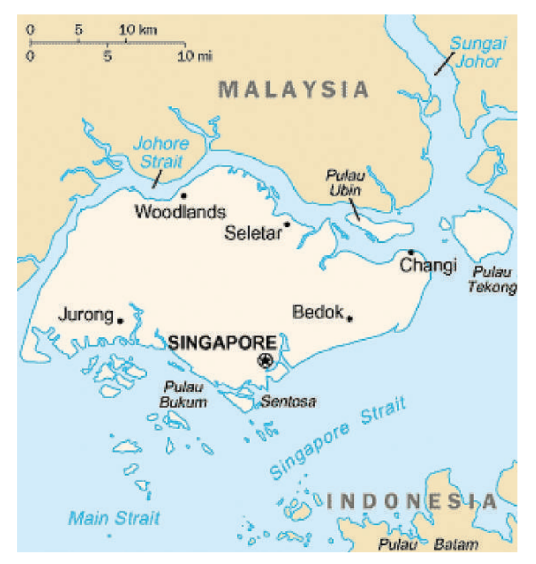
Pic. 3 – Singapore surrounded with water. A picture perfect for a spread-out concept providing water and power for life support. The 5.7 million people metropolis may become completely self-sufficient providing low cost fresh water and power for the current and future life support