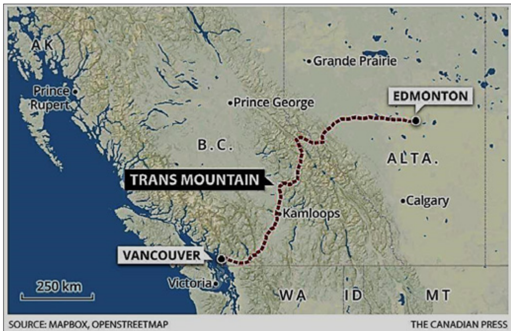
Figure 1 – Path of Trans Mountain Pipeline extension. Approved by Canadian Government for construction on 18 June, 2019

These factors limit the growth of heavy oil production in Canada, negatively impacts on the economics of oil producing companies in Canada developing the heavy oil reserves, damages the country's economy as a whole. The debottlenecking in the oil marketing could