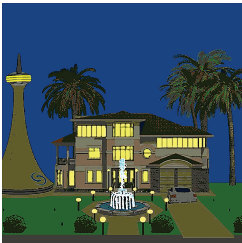
Pic. 5 – An example of a small unit to provide power to a village, mansion, mobile military squad, animal farm or temporary settlement. Provides for 100% autonomous supplies of power and water.