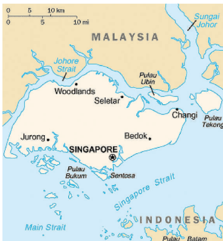
Pic. 3 – Singapore surrounded with water. A picture perfect for a spread-out concept providing water and power for life support. The 5.7 million people metropolis may become completely self-sufficient providing low cost fresh water and power for the current and future life support