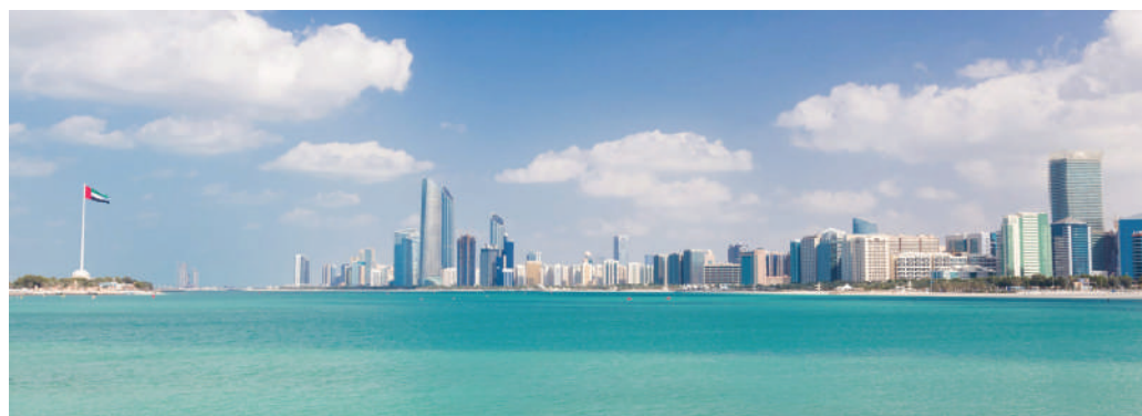
Pic. 3 – Abu-Dhabi is another costal metropolis with futuristic Masdar-City division that may find viable resolution to its water/power scarcity with SWEM technology. Never has to use purified second-hand water any more. Excess water can be used to turn the desert around the metropolis into agricultural land.