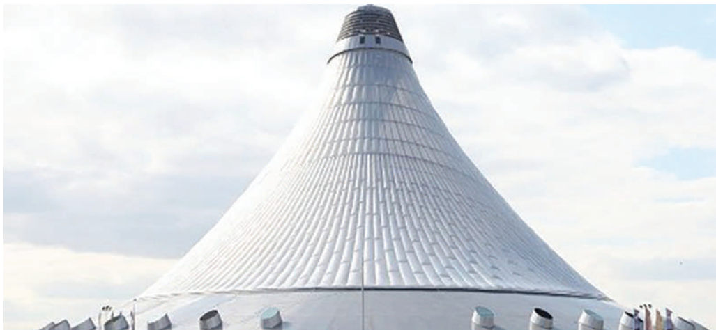
Pic. 4. – A mega power/water plant shape. Could be built at a sea cost, offshore foundation or in a desert.